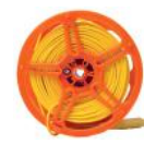
test lead 50 m, yellow, for MRU (banana plugs, on a reel)