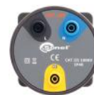
AGT-16T industrial socket adapter 16 A

AGT-63P three-phase socket adapter 63 A - WAADAAGT63P