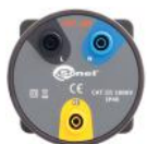
AGT-32T industrial socket adapter 32 A