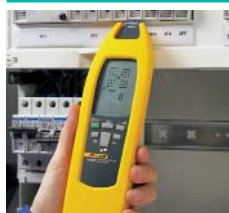
Location of fuses/breakers and assignment to circuits