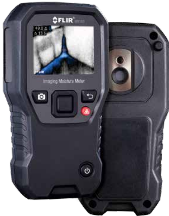
MR160 Imaging Moisture Meter